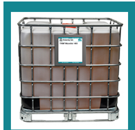
270-gallon tote SKU: MS485/NR270P UPC-12: 641238066552