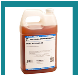
1-gallon jug SKU: MS485/1 UPC-12: 641238066378