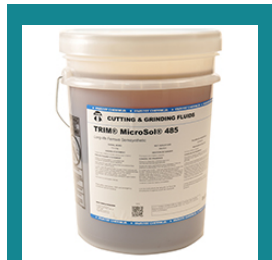
5-gallon pail SKU: MS485/5 UPC-12: 641238066354