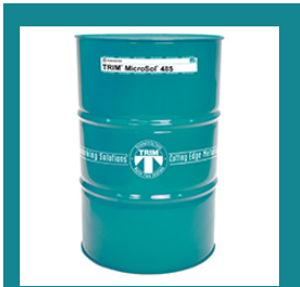
54-gallon drum SKU: MS485/54 UPC-12: 641238066347